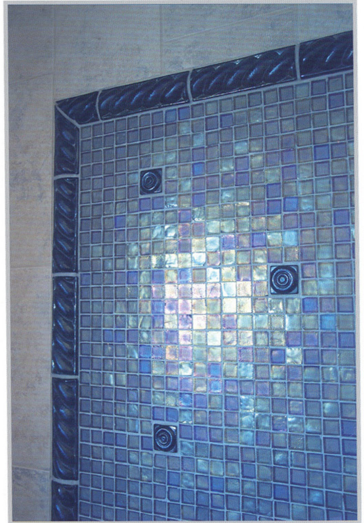
"Sand and Sea" colors create a luxurious beach spa in the waterfront Show House master bath.

Polished Easton's Beach marble slabs begin the soft layering of warm sand colors against these cool water tones. The marble vanity top, tub deck, backsplash and side splashes are finished with a waterfall ogee edge. Tumbled marble oxbow tiles, also in Easton's Beach, cover the shower floor.