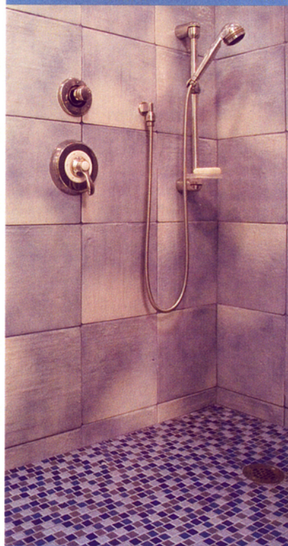
BEAUTY IN THE BATH At left: Unique accent tiles (above) and glass tiles in beautiful cool tones (below). Above: Marble-tiled shower with a glass tile floor. Shades of blue in this bath featuring extra large tiles. All tile and design from Weatherly Tile & Stone.